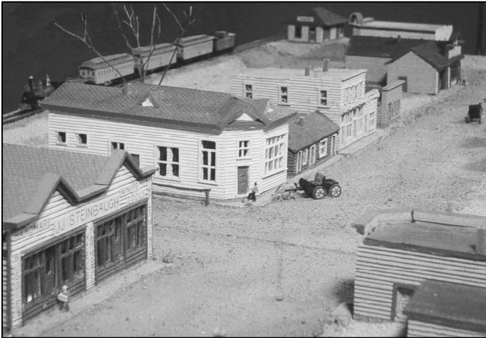
This view of Front & Spruce on the replica shows Steinbaugh’s Hardware on the left, the Old Louisville Inn building in the center, and the railroad depot at the back of the picture.

used small handsaws, dental picks, and other small tools to achieve the appearances he wanted, and found that he could use the reverse side of Masonite to give the effect of shingles. (However, only a small fraction of the replica is made from manufactured materials.) Just as “red ash” from the coal mine dumps was spread on the streets of Louisville at one time, the red ash used for the streets on the replica is real red ash that came from Walnut Street.