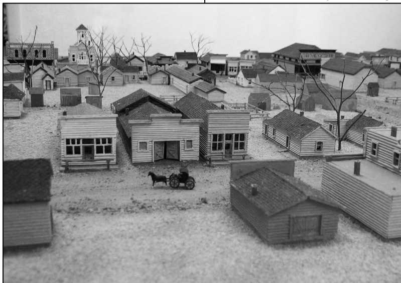
This view of the replica of Louisville looks west from the railroad tracks over the 700 block of Front Street, with Main Street behind.