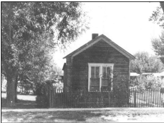
1436 Cannon, shown in 1948, was a characteristically small miner's house in the Little Italy neighborhood.

Join Diane Marino on a walking tour of the Little Italy neighborhood (north of Griffith Street between Main and Highway 42), where her grandparents made their home. Meet at the intersection of Front Street and Griffith Street; street parking is available. Suggested donation: $5 per person.