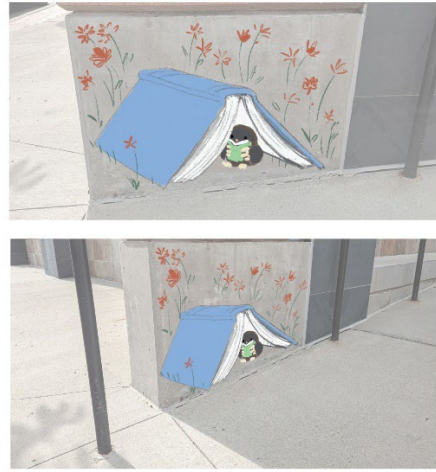
EAST RAMP ENTRANCE (WALL CLOSEST TO BUILDING)