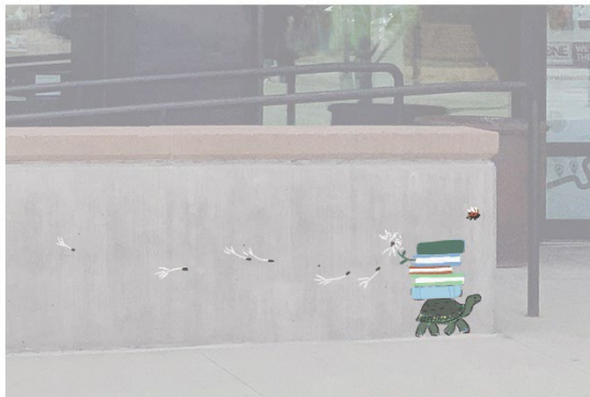
EAST ENTRANCE RAMP + FRONT DOORS