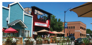
Historic Downtown Louisville