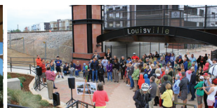
Downtown East Louisville