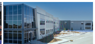
Colorado Technology Center