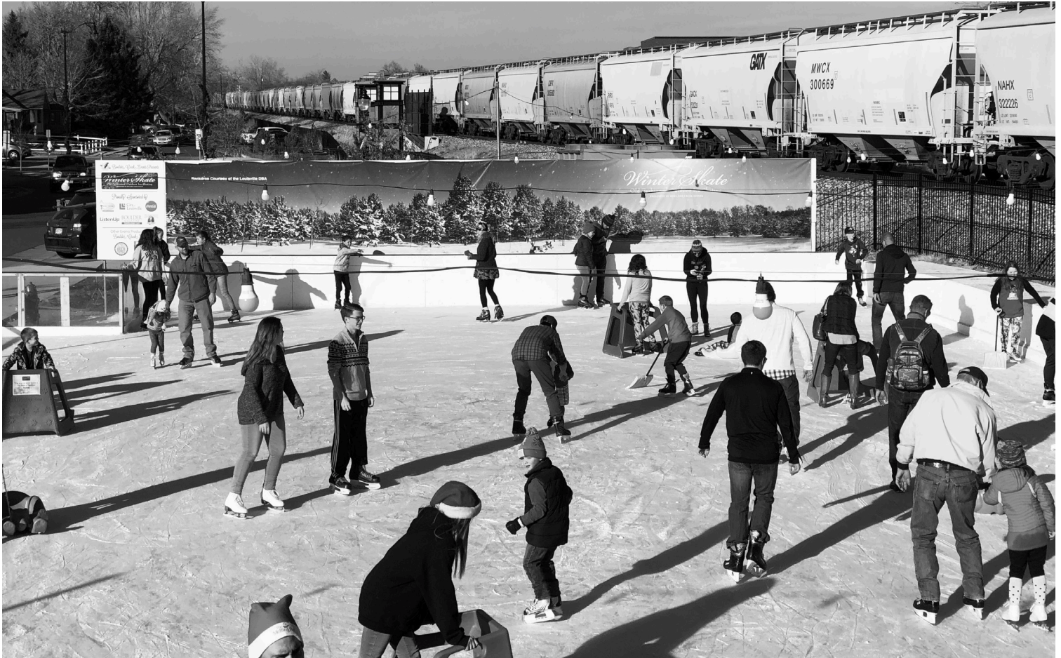
WinterSkate outdoor ice skating at the Steinbaugh Pavilion on Front Street