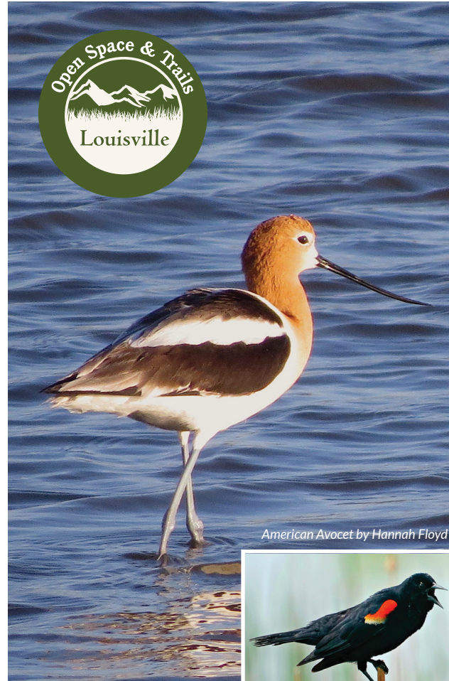
American Avocet