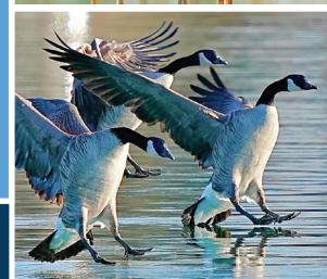
Bald Eagle, Red-winged Blackbird, Canada Geese by Pappa Dukes