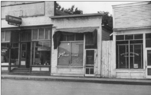
Photo showing businesses on the corner where City Hall (749 Main St.) is now, 1948.

Louisville’s historical downtown buildings contribute to its strong sense of place. At this event during Preservation Month, we’ll use the Museum’s historic photo collection to look at images of buildings that are gone, including Front Street saloons and Main Street grocery stores. Members of the Historic Preservation Commission will be on hand to chat with visitors and answer questions about Louisville’s Preservation Program.