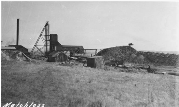
The Matchless Mine and mine dump, early 1900s.