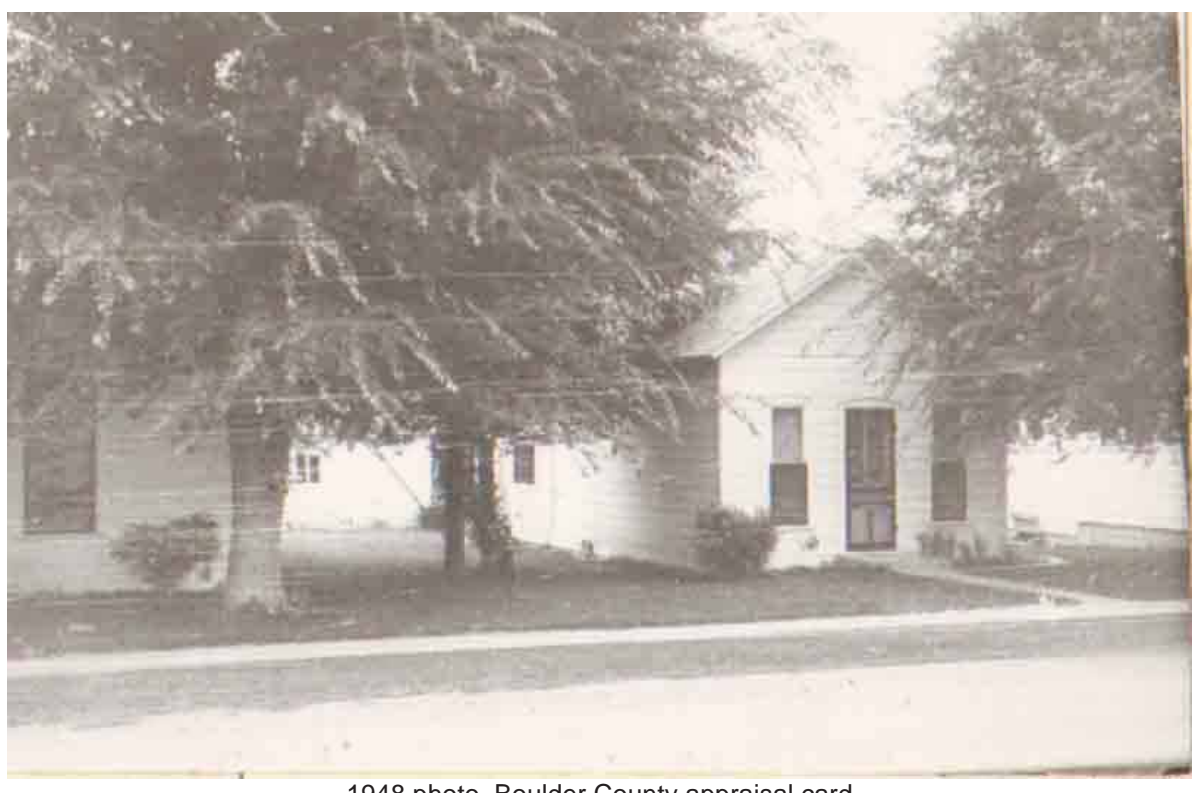
1948 photo, Boulder County appraisal card