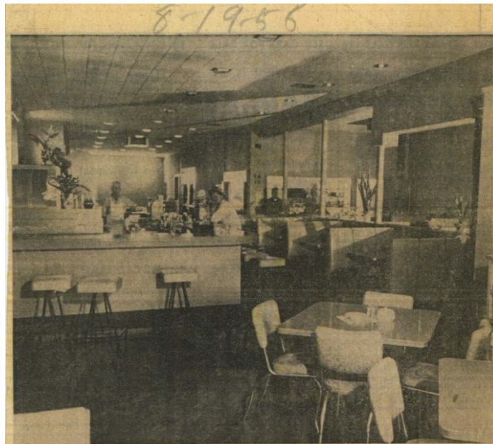
THE NEW COLACCT'S —The grand opening of the new Colacci's restaurant in Louisville is scheduled for this Saturday night. The new Colacci's bears little resemblance to the old restaurant popularly called by the same name, as the above picture shows. This view looking toward the rear of the new location shows a portion of the interior. The bar is at the left with three rows of booths to the right extending through the archways. The kitchen is in the right rear.

In August 1955, Colacci's Restaurant held its Grand Opening. (See the end of this report for a Daily Camera article describing its layout and amenities, which included a bar with a piano and a kitchen on the back with a walk-in refrigerator.) The following newspaper photo from August 1955 shows the interior: